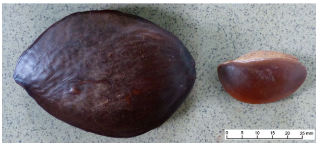
FIGURE 1. The seeds of two tree species, Pentaclethra macrophylla (on left) and Gambeya lacourtiana (on right), used in the study.

If all seeds remained untouched after seven days, we closed the station and established a new experimental site. If some or all seeds were removed, we recovered the telemetric thread tags and attached them to new seeds, and we established a new station on the opposite side of the same tree (10–20 m away), or at an entirely new location if two experimental sites had already been used there. In one instance, we repositioned a trail camera to continue monitoring a tagged seed that had been removed and cached nearby. Equipment and field limitations prevented us