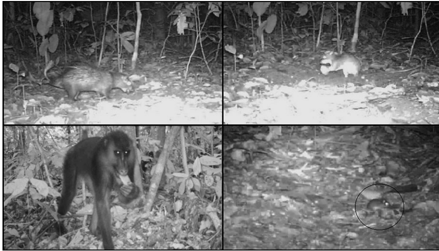
FIGURE 2. The major terrestrial mammalian seed predators of the Ipassa Reserve, 'caught' removing seeds from experimental stations. Clockwise from top left: African brush-tailed porcupine ( Atherurus africanus ), Emin's giant pouched rat ( Cricetomys emini ), small Murid rodent (Family: Muridae; circled), and mandrill ( Mandrillus sphinx ). Still images were taken from motion-sensitive trail camera videos.

from following seeds over time in all other cases; our data are limited to the first movement of seeds and their initial fate.